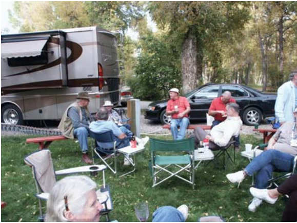
From the Chama Rally