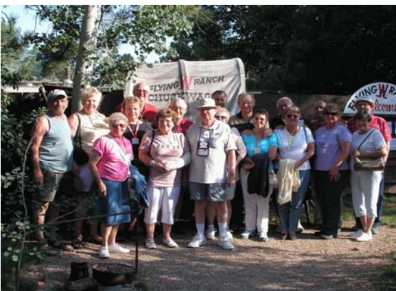
Discovery Pioneers in Manitou Springs in July