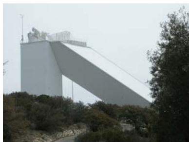
Kitts Peak Solar Observatory

While we were in Yuma, we toured the countryside, marveling at the tremendous agricultural flavor of the valley. We saw huge fields of lettuce, broccoli, onion, strawberries...you name it, they grow it. We were told that if one drives down a road and spots a harvesting crew near the road, we should stop and get out of our car. We did, and we were given eight HUGE heads of freshly-cut lettuce to take home with us. The workers cannot accept money, so it was a real treat. We shared with friends and I must admit...I don't care for head lettuce, but this had to be the best I've ever tasted.